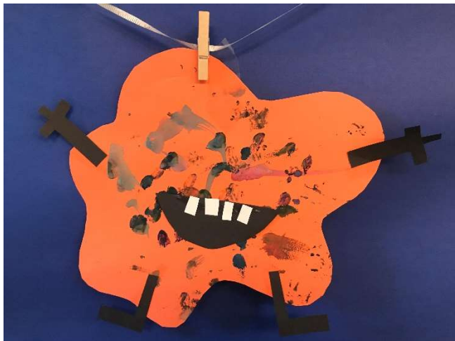
TreeTop Village-Edward Szostak